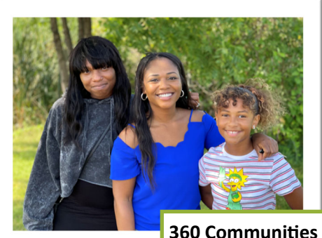
360 Communities South Chapter - Dakota County